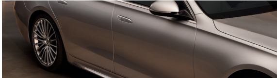
Paintless Dent Repair