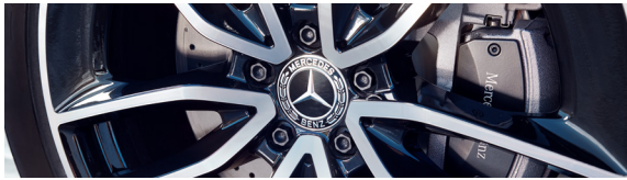
Tire and Rim Protection