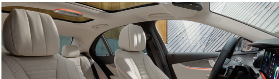
Interior and Exterior Protection

First Class Tire and Rim Protection and First Class Interior and Exterior Protection are available as stand-alone products. First Class Paintless Dent Repair, Windshield Protection, and Key Protection are only available within Multi-Coverage Protection Packages.