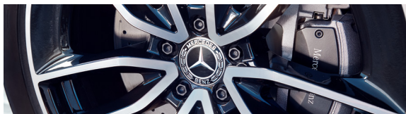
Tire and Rim Protection

Multi-Coverage Protection Package options include various combinations of the following: