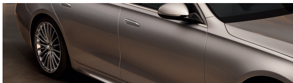
Paintless Dent Repair