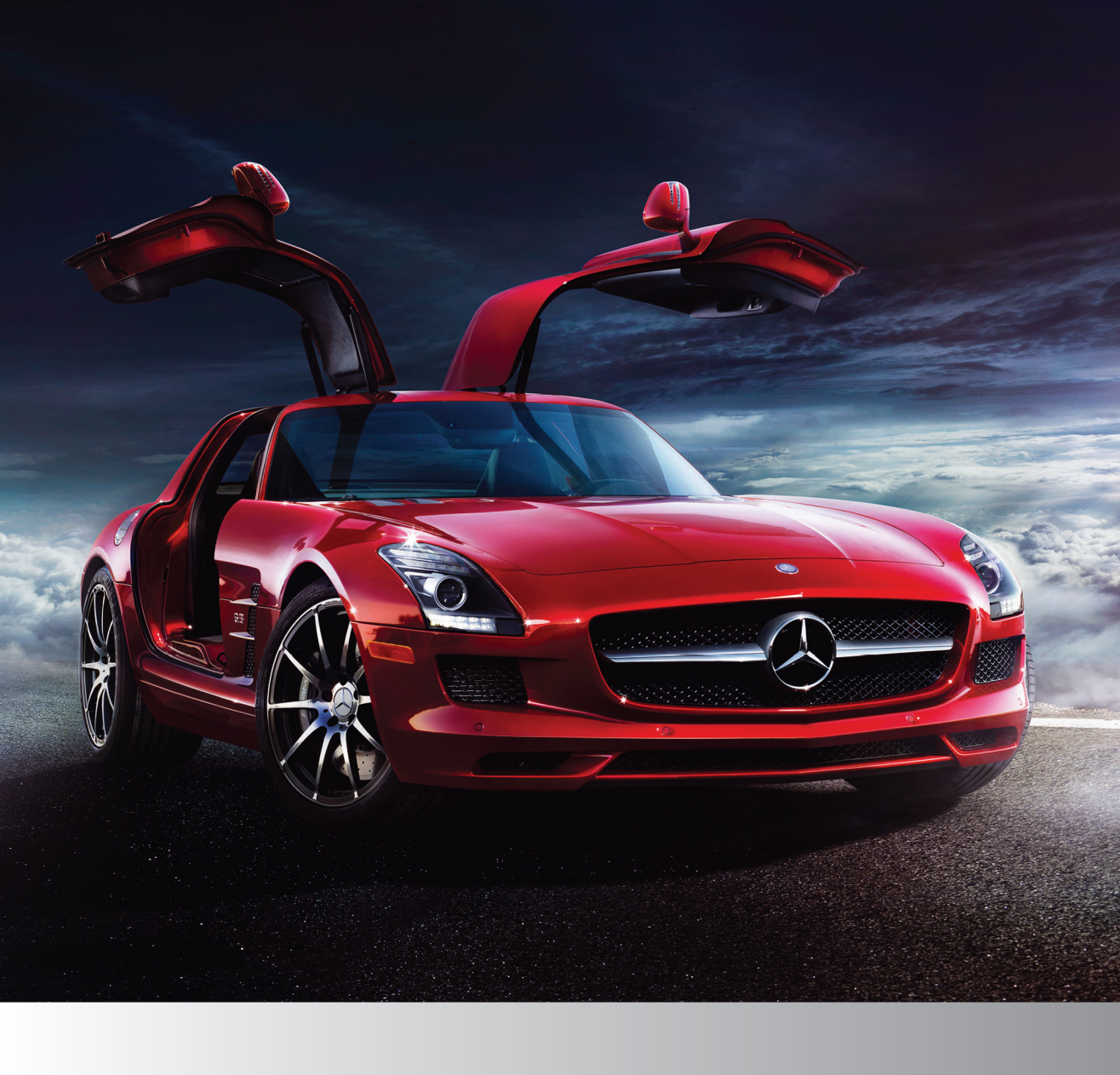
SLS 2013 Service Booklet