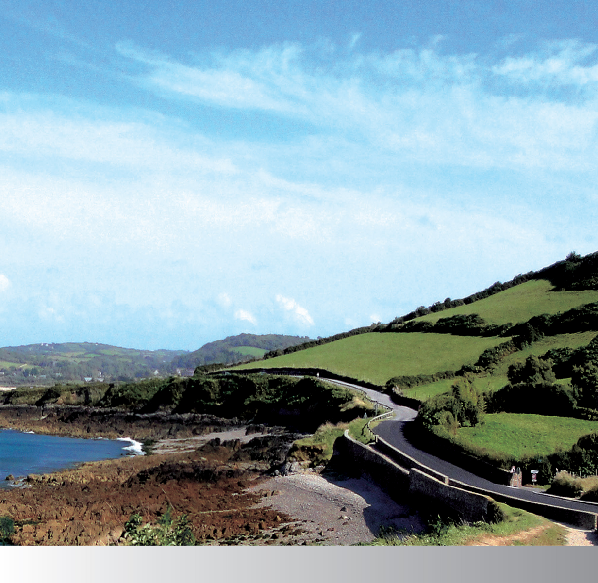
B-Class 2014 Service Booklet