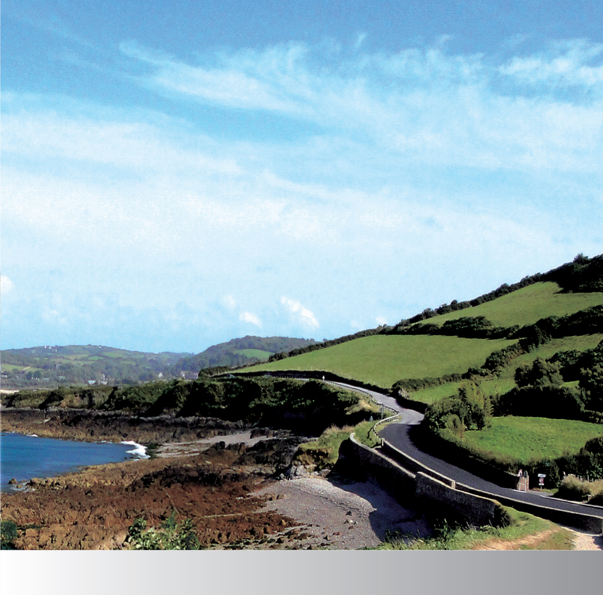
G 2014 Service Booklet