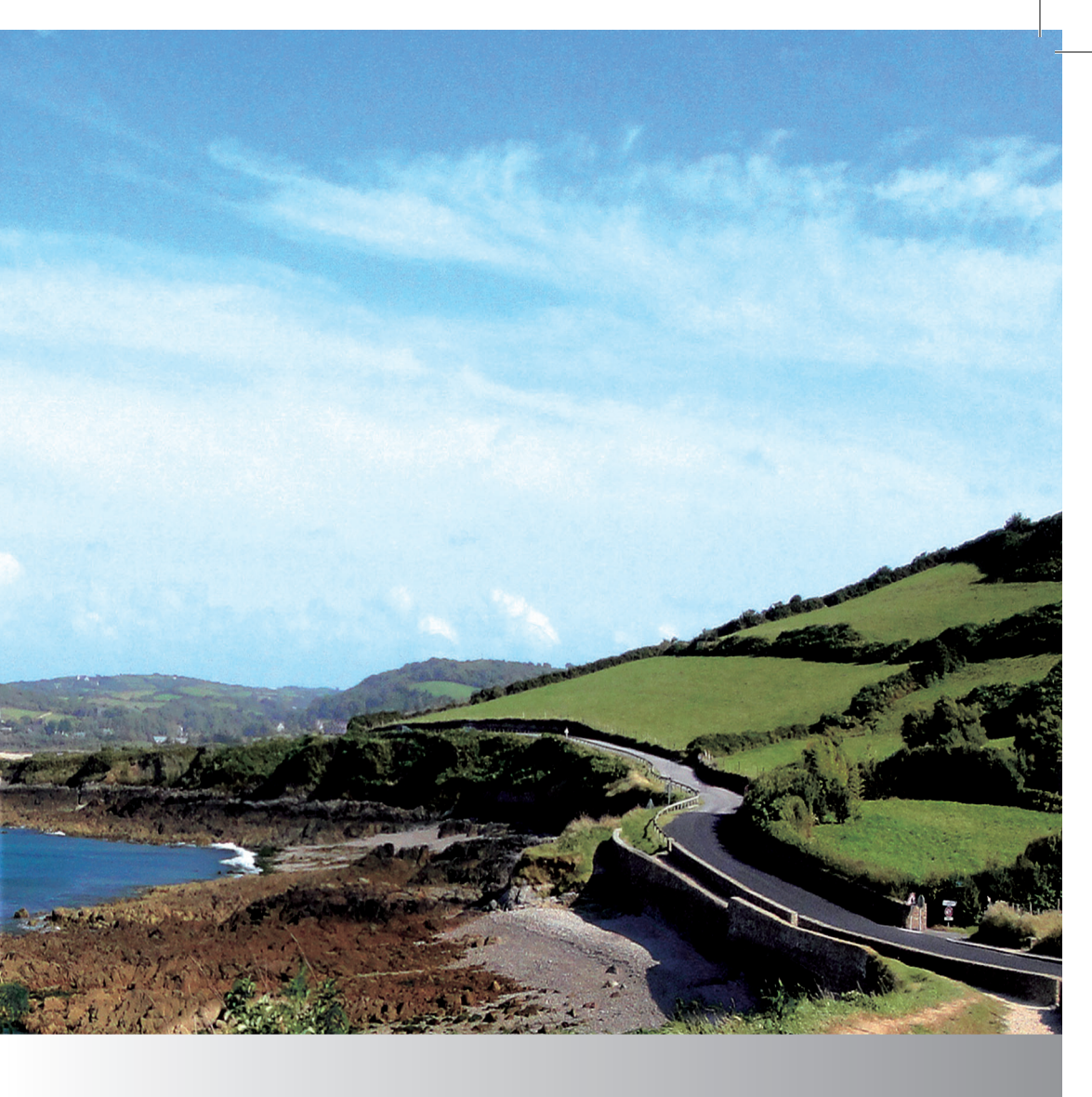
GL, ML 2014 Service Booklet