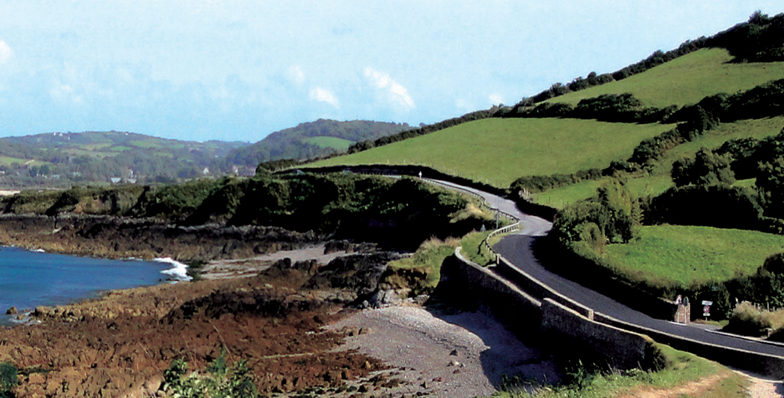
SLS 2015 Service Booklet