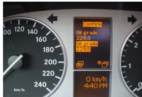
Select Oil grade 229.5 (step 13).